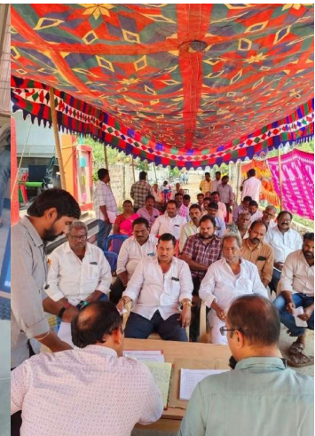
Figure 2: Village wise consultations held by the CAs during the preparation of RAP