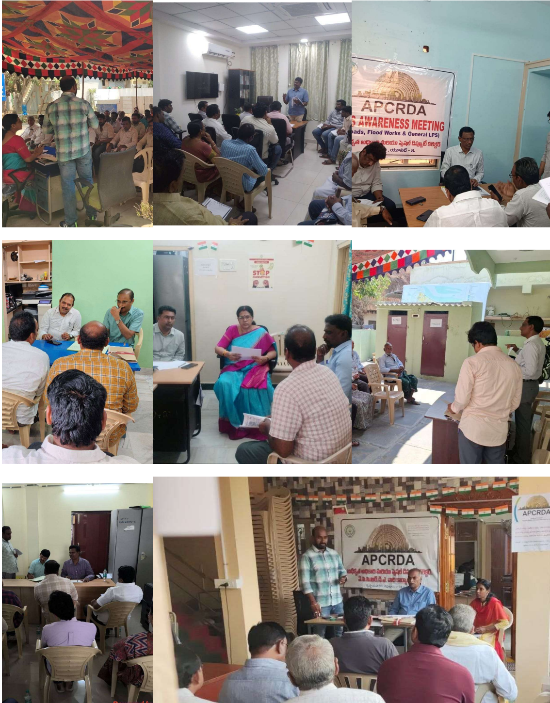
FIGURE 2: PUBLIC AND CAS INTERACTION DURING THE CONSULTATIONS FOR TRUNK WORKS